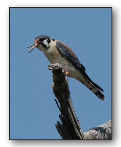
Southeast American Kestrel near Box 17

So far we already have four boxes with Kestrel eggs, for a total of 13 eggs. This is a good sign for this early in the nesting season. We expect that more boxes will be Kestrel homes when we check later this month. In fact, adult Kestrels were flushed from the area around two other boxes.