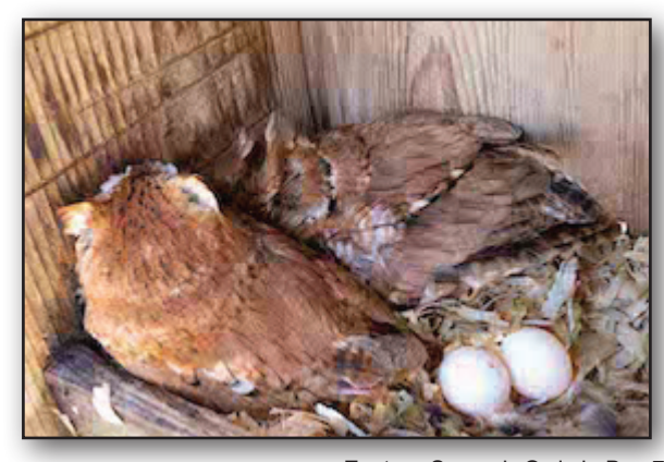
Eastern Screech-Owls in Box 7

Other inhabitants were the usual suspects, 5 boxes with Eastern Screech-Owls, 4 with Great Crested Flycatchers, 1 with Eastern Bluebirds, and thankfully, just one box with a single Southern Flying Squirrel.