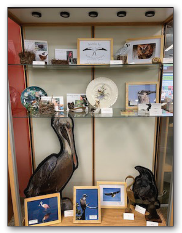
On display through mid September.