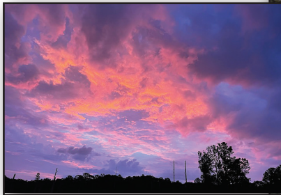
Sunrise over Lake Serena

Finally, Santa Fe Audubon Society would like to thank all of the many private property owners who allow us to visit their properties to conduct this annual survey.