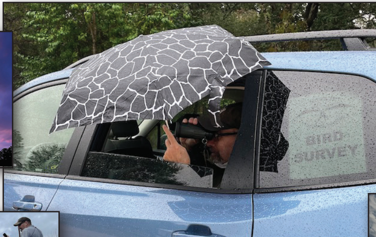
One of our dedicated volunteers