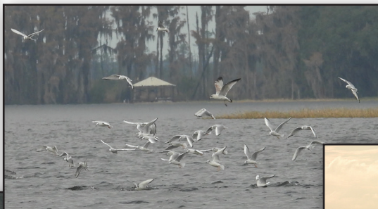
Gulls and CBC Team on Lake Santa Fe