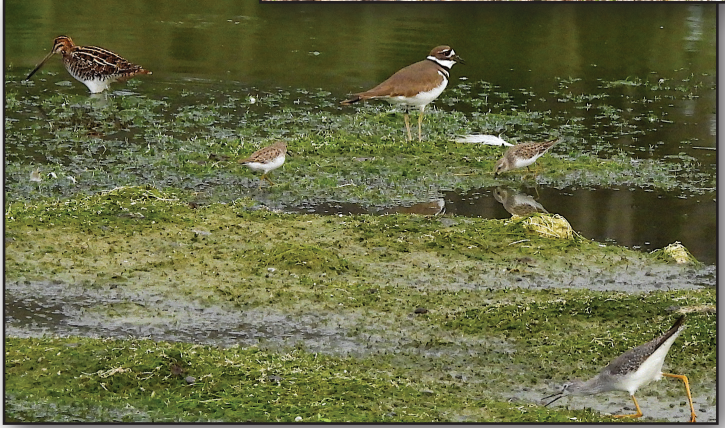
L to R: Wilson's Snipe, Least Sandpiper, Killdeer, Least Sandpiper and Lesser Yellowlegs

A shorebird you can see without going to the beach, Killdeer are graceful plovers common to lawns, golf courses, athletic fields, and parking lots. These tawny birds run across the ground in spurts, stopping with a jolt every so often to check their progress, or to see if they've startled up any insect prey. Their voice, a far-carrying, excited killdeer, is a common sound even after dark, often given in flight as the bird circles overhead on slender wings.