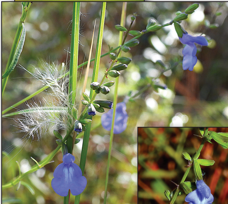
Azure Blue Sage