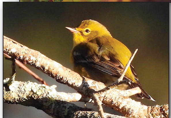
Pine Warbler - male