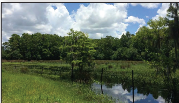
Grubb Ranch in Hardee Co

In early October the state of Florida approved more than 40,000 acres for conservation as part of the Florida Forever and Rural and Family Lands Protection Programs.