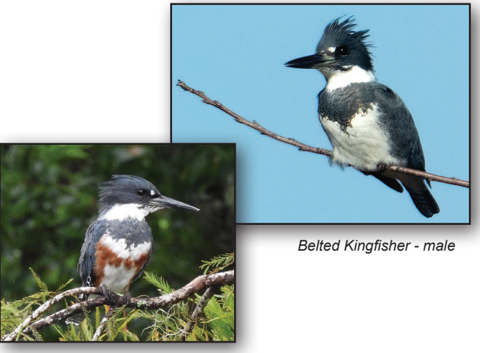
Belted Kingfisher - female

have one blue band across the white breast, while females have a blue and a chestnut band.