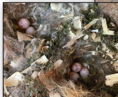
Tufted Titmouse nests