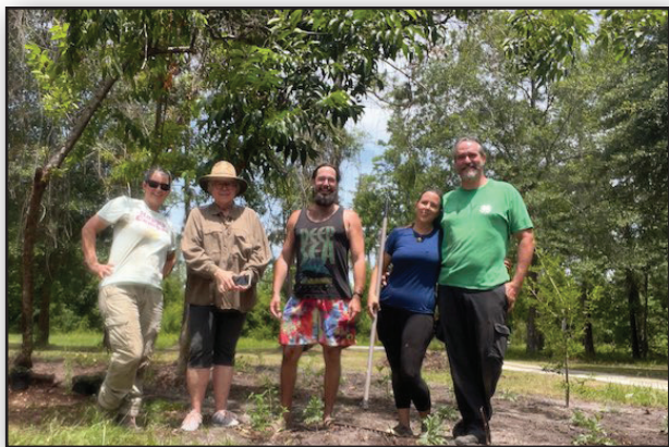
Phase 1 native plant installation, June 2024

Santa Fe Audubon has committed money for the phase 2 native plant installation for the Florida Coalition for Peace and Justice in Hampton Florida. This facility provides meeting spaces for community retreats, workshops, camps and education. It has 15 acres to hike explore and enjoy birds.