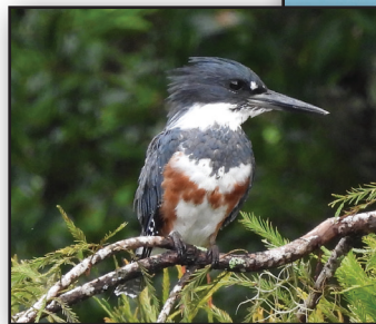
Belted Kingfisher - female