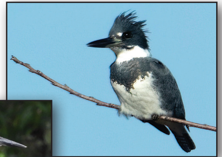
Belted Kingfisher - male